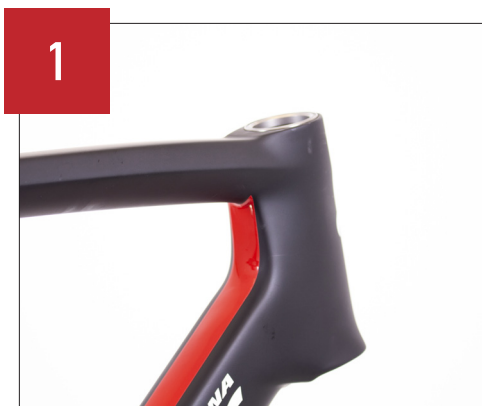
1 Place the upper and lower bearings in the head tube of the Cento10 Hybrid frame.