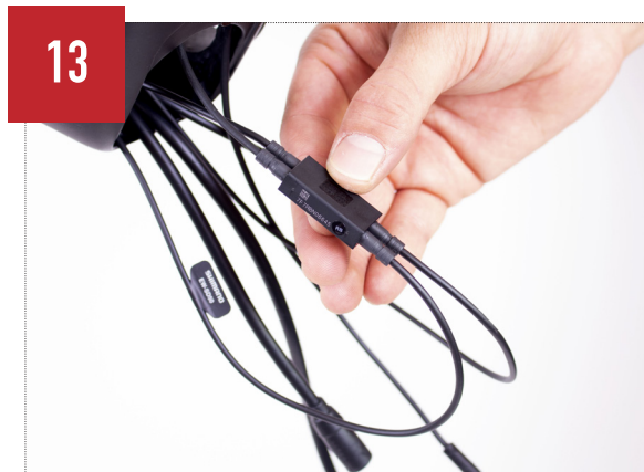
Connect the Shimano SM-JC41 hub to all electronic cables. Place the hub inside the down tube.