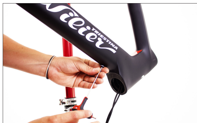
4 Fix the battery vertically to the down tube using two screws with a maximum length of 8 mm.