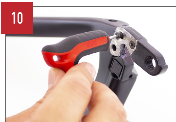
Attach the dropout to the frame.