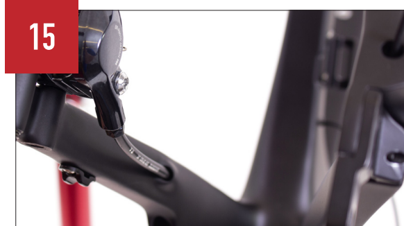
Secure the rear brake calliper to the chainstay.