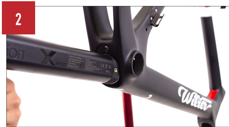
2 Insert the battery inside the down tube, passing it through the hole positioned on the underside of the bottom bracket. The battery must be inserted so that the end with two terminal cables is facing towards the head tube, while the end with three output cables is facing towards the bottom bracket.