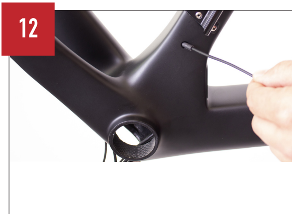
Insert the 350 mm Shimano electronic cable into the derailleur hole (it will be connected to the derailleur).