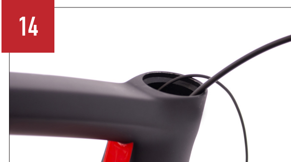
Pass the rear brake hydraulic cable along the frame until it exits from the upper hole of the head tube.