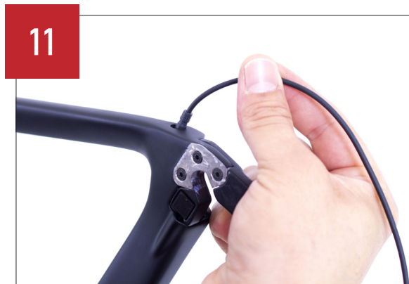
Feed the 700 mm long electronic cable through the chainstay (it will be connected to the rear shifter).