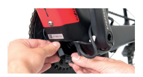
11. Fix the charging point with the tightening screws, placing the plastic cover properly.

10. Connect the battery cable to the corresponding one of the charging point.