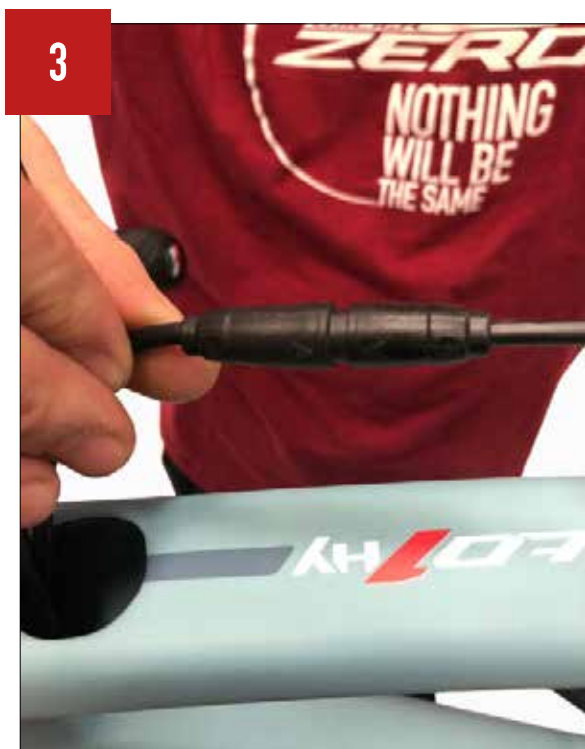
Connect the battery connector to the corresponding one of the ANT+ conversion kit